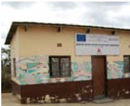
Above: The Ebenezer Welfare Supporting and Caring Organisation. Below: Woman involved in income generating at the project.

Further funding will enable us to strengthen our capacity and training and make the model available to other communities in desperate need of development and training.